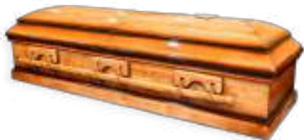
The Shalom Maple 358BA