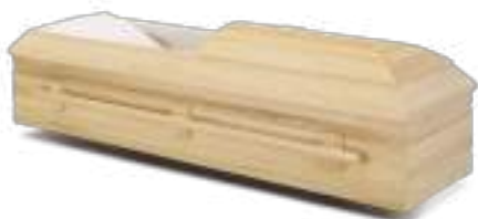
The Jacob 5510BA