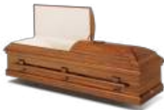
The Rehovot 1H49