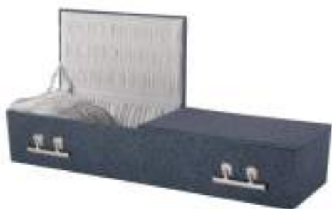
Grey Cloth 150HP