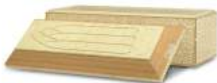
The Venetian 000003