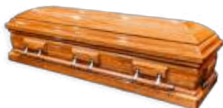
The Provincial Oak 799BA