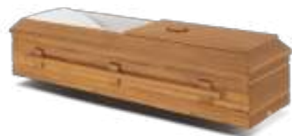
The Zion 1H15