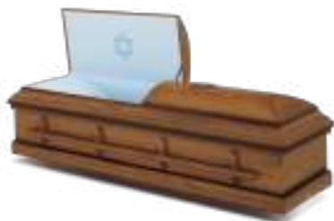
The Magen David Oak 761BA