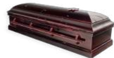
The Odessa NOR105