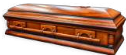
The Shalom Cherry 425BA