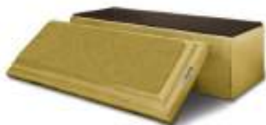
The Monticello 000002