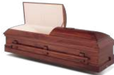
The Beersheba 760BA