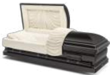
The Marsellus 3BA