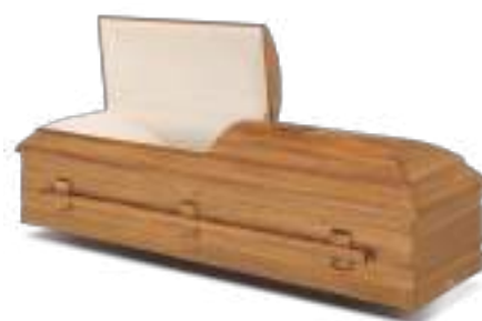
The Jerusalem 5508BA