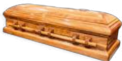
The Kosher Walnut BA99