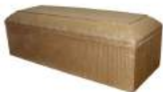
The Monarch 000001