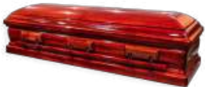
The Kasher Mahogany Supreme 2BA