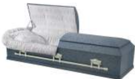
The Winston 160KP