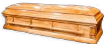
The Shalom Hardwood 1JXX