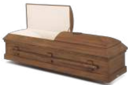
The Jewish Kasher 1H37